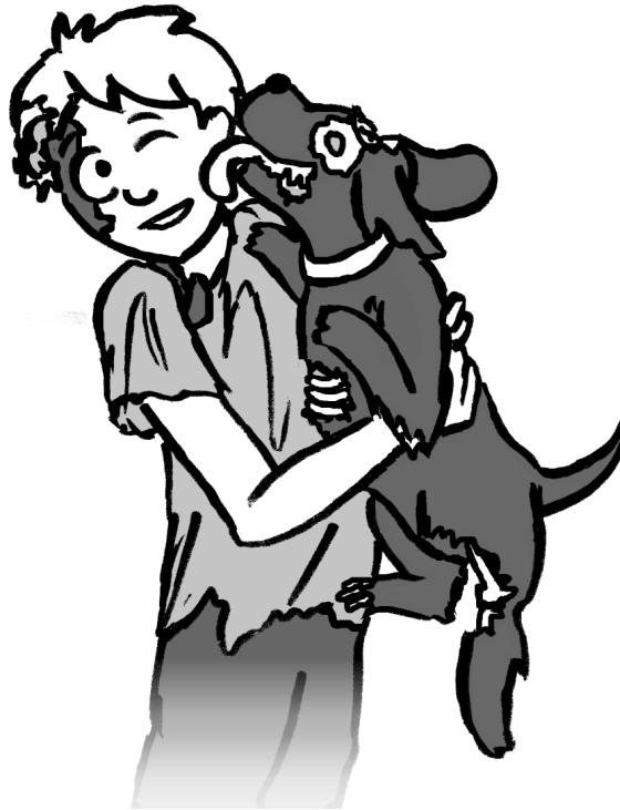
Spokeszombie and Junior Goodwill Ambassador Tim loves to play with his Zombie dog, Patches.

“Resident Evil: Bad for Zombies, Bad for America” by the Zombie Rights Campaign is licensed under a Creative Commons Attribution-Noncommercial 3.0 United States License